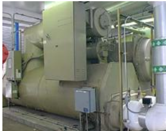
Figure 2. Chiller

Normally, for centrifugal compressor-based chillers, an increase of one degree in the chilled water supply temperature can increase the operational efficiency of the chiller by 1 to 2 percent. If a chiller can supply chilled water at 55°F, it will be approximately 15 to 30 percent more efficient than when it produces chilled water at 40°F (cooler). Based upon energy benchmarking and on-site observation, it is often feasible to implement a chilled water temperature reset to improve chiller performance whenever the system allows.