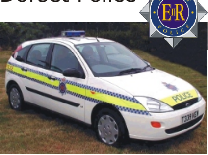
All Dorset Police stations were fitted with Savastat following a comparative trial conducted during one of the harshest winter periods. With temperatures below freezing and high load conditions savings of 15.69% were achieved.

Gallaher Ltd. head office have Strebel boilers working with the air conditioning system. Adding Savastat gave a payback in 9 months .