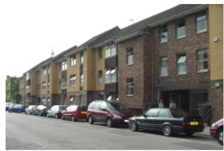
Portsmouth Town Court

Two Hoval GS boilers were used at the Portsmouth site to evaluate Savastat. Fuel consumption was reduced by 19.79% Payback would be achieved within 6 months.