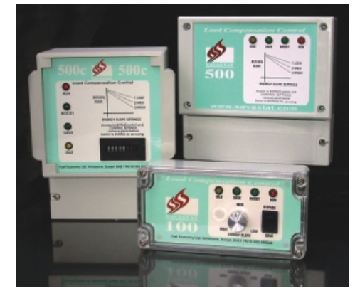
Model Range All use the same basic load compensation software. The three models have different modes of adjustment to suit all boilers of any size, burning gas, oil or LPG.

It measures rate of temperature loss of the return water at the boiler to assess system load and when opportunities arise compensates for reduced loads by dropping the boiler operating temperature by a few degrees. Reductions of only 2°C to 5°C will achieve significant savings in fuel consumption.