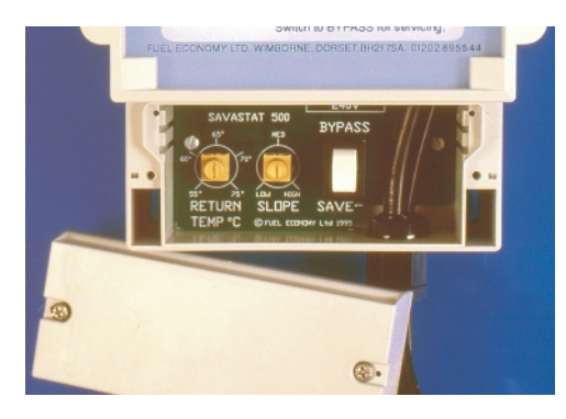
Model 500 control settings to match system operating conditions are located behind a panel to prevent unauthorised tampering.

All system controls will continue to control space and hot water temperatures independently of any action by Savastat. Because Savastat is measuring the result of all system controls at the boiler it complements their actions. Savastat cannot change space temperatures.