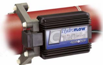
HydroFLOW-C Series Water Conditioners