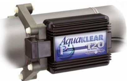
AquaKLEAR-P Series Water Conditioners

Over 500,000 global installations with 100% Success!